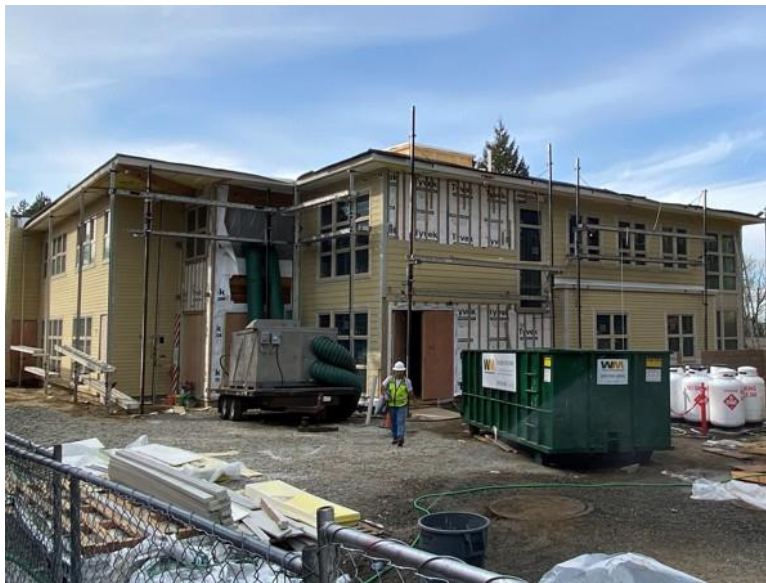
The latest photograph of the new Kirkland Shelter for Families & Women!

Thank you for supporting our mission to end homelessness for women in our community.