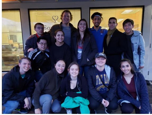
A team from Rotaract Club at UW Bothell and University of Washington Bothell Beta Alpha Psi