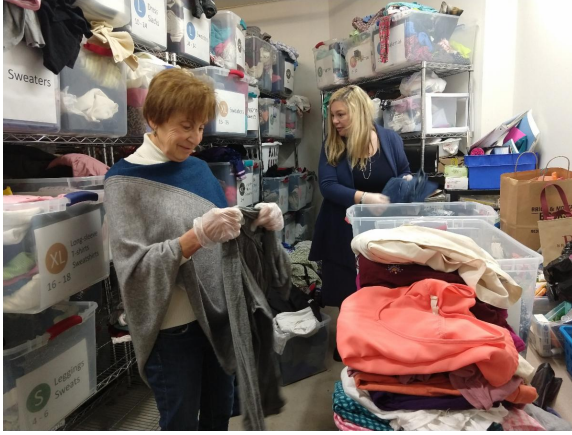
A group from Herzl-Ner Tamid Conservative Congregation