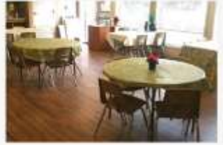
Sophia's Day Center in Bellevue