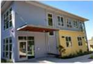
Helen's Place Emergency Shelter in Kirkland