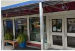
Sophia's Place Extended-Stay Shelter in Bellevue