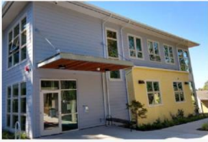
Helen's Place Emergency Shelter in Kirkland