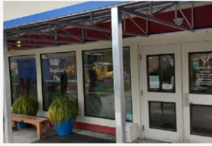
Sophia's Place Extended-Stay Shelter in Bellevue