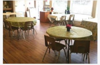
Sophia's Day Center in Bellevue